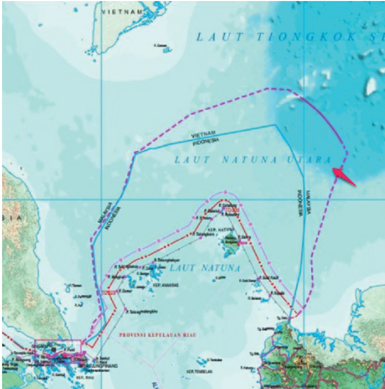
FIGURE 2 “New Indonesian Map”, available at https://portal.ina-sdi.or.id/home/node/134 , accessed on 12 September 2019.